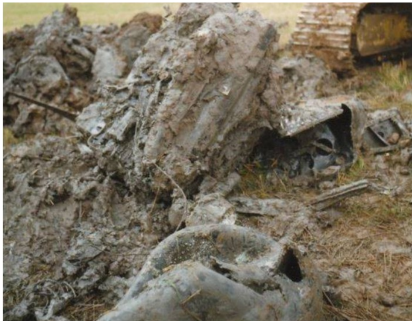
The Peregrine engines, covered in mud and clay, following their recovery from P696's crash site during the 1970s.

The crash-remains of Whirlwind P6966 did offer up both Rolls-Royce Peregrine engines though. For those who may not have heard of this engine, Peregrines were the ultimate offshoot of the Rolls-Royce Kestrel V-12. They are exceedingly rare, however, as the Whirlwind was the only production aircraft ever to use them. Both of P6966's Peregrines were badly damaged in the wartime crash though; furthermore, they are now in the Rolls-Royce Heritage Trust museum in Derby .