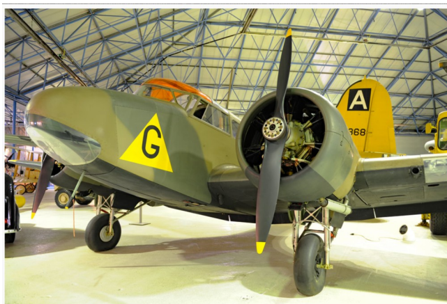
Airspeed AS.10 Oxford MP425 similar to those used by No. 1516 BAT Flight

Odiham was now somewhat deserted following the move of the squadrons to Europe, with No. 1516 Blind/Beam Approach/Radio Aids Training Flight (BAT) arriving on 17 September 1944, flying Airspeed Oxford aircraft.