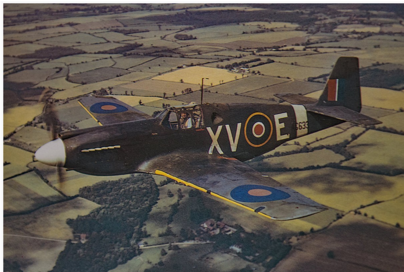
North American Mustang I similar to those flown by No. 400 Squadron

In July 1942, Odiham's No. 400 Squadron had converted to the North American Mustang Is and, along with No. 13 Squadron's Blenheims, had taken part in the air battle above Dieppe.