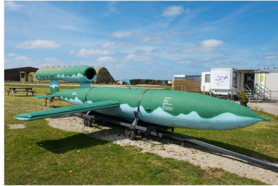
V1 Flying Bomb

In response to the invasion of Europe, Hitler retaliated by sending over scores of V1 flying bombs, with the first falling on London on 13 June 1944, one week after the start of Overlord. Hundreds were targeted at south-east England, with most crossing over Sussex and Kent, but with some entering Hampshire's airspace.