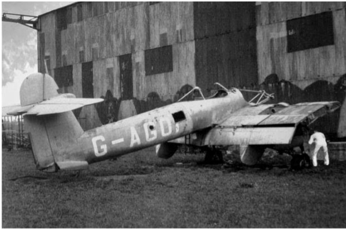
The last of the line, Westland Whirlwind G-AGOI on its way to the scrap yard at Yeovil in the late 1940s.

untrue, as several eye witnesses remember seeing it towed down to a scrap yard a short distance away. A very sad end to what was an advanced aircraft for its time.