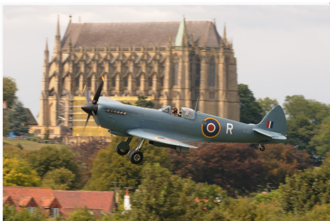
Supermarine Spitfire PR IX PL965 similar to as used by No. 400 Squadron - Image Richard Hall.

On 18 February 1944, No. 400 Squadron returned to Odiham with their Spitfire PR MK.IXs and Mosquito PR XVIs, they were then joined briefly by No. 184 Squadron, flying Typhoons.