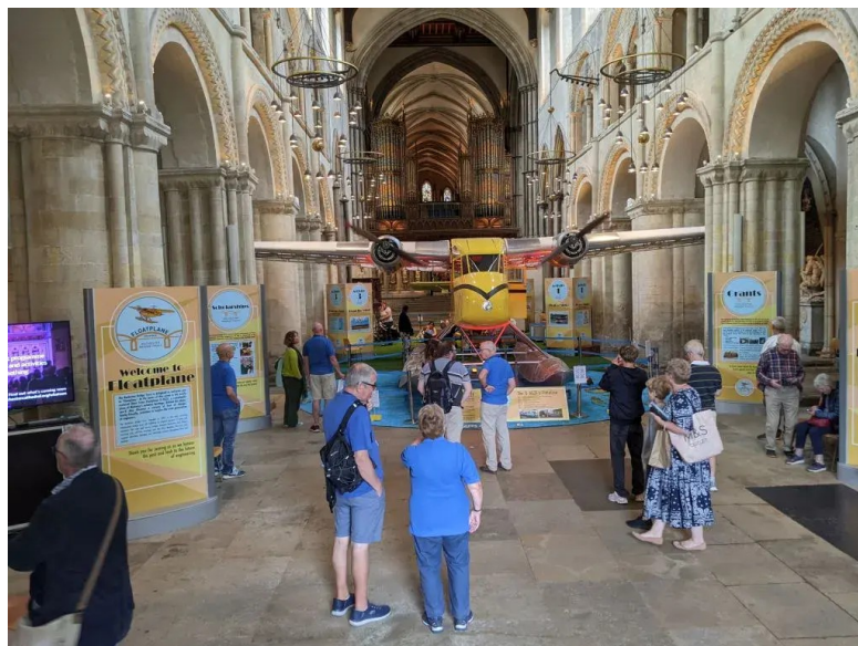
The newly restored Short Scion floatplane on display at Rochester Cathedral

We then had to make all the walkways with anti-slip on them. We also have a stainless steel float strut which came from Australia. Acquiring this meant that we knew what the ends of the floats looked like. We could then machine them and clad them up with mild steel, which was then welded and painted.