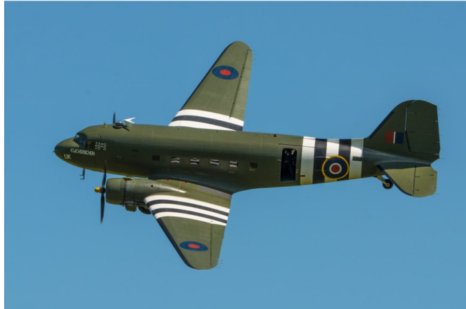
Douglas Dakota C.3 ZA947

The Dakotas ferried fuel, medical supplies and food to the Continent, bringing back troops and rumour has it, William Joyce, the infamous Lord Haw-Haw, who kept the Allies entertained with his propaganda broadcasts from Germany throughout the war.