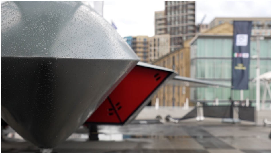
Tempest will be able to generate, receive and share data

This can then be shared with other aircraft in what the RAF terms a "combat cloud".