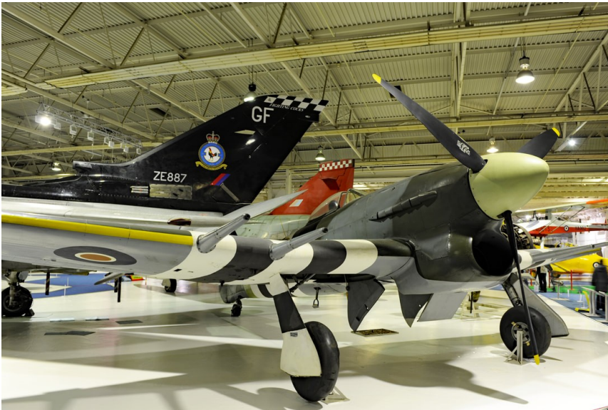
Hawker Typhoon IB MN235

The end of 1943 saw Italy declaring War on Germany, the Anzio landings and the arrival at Odiham of two Hawker Typhoon squadrons. In early 1944, Nos. 181 and 274 carried out attacks on 'Noball' sites, which was the name given to Hitler's V weapon launch locations in France. As early as May 1943, the Allies had become aware of the existence of construction sites in Northern France to launch V1 flying bombs and V2 rockets. The plans Hitler had to use these weapons became a priority for the Allies to defeat, and a number of operations were put in place.