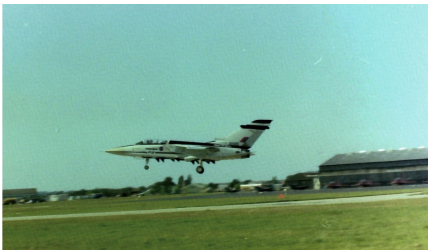
Tornado F.2 prototype ZA254 at Farnborough 7th September 1980.

On this day in aviation history, 46 years ago (October 27, 1979), the Panavia Tornado ADV flew for the first time. The Tornado ADV (short for Air Defence Variant ) is a long-range interceptor that was developed in Europe by the Panavia Aircraft GmbH association. This twin-engined, swing-wing fighter was a derivative of the Panavia Tornado multi-role fighter. Development of the aircraft began in 1976 with the intent to develop an interceptor to handle Soviet bombers. At the time, these bombers were flying over the North Sea, leaving the United Kingdom vulnerable to possible Nuclear strikes.