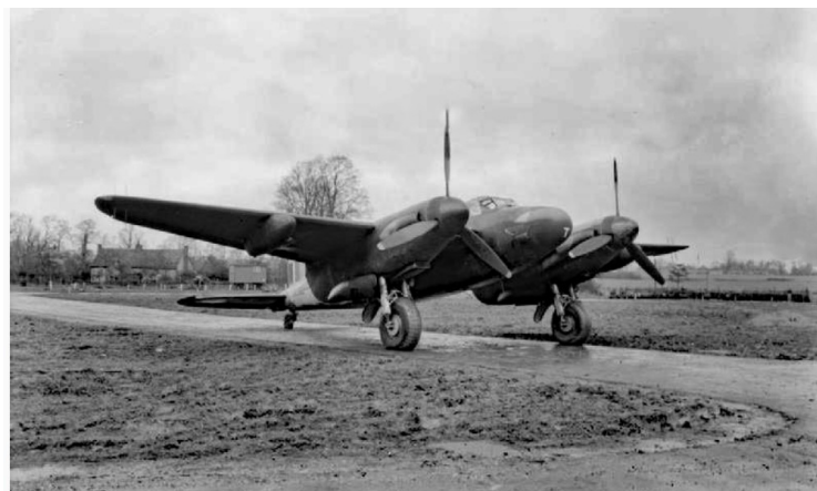
De Havilland Mosquito NF.VIII - Image - commons.wikimedia.org

To counter the threat, scores of anti-aircraft guns were used to shoot down the V1s as flying in a straight, predictable line, they could easily be tracked but were a very small target. Many were brought down, but some still got through. Air interception was also implemented, and the day's fastest aircraft were sent up to bring the V-1s down. Tempests, Spitfires, Mosquitos and even Meteors all had a go at anti Diver operations, the name given to the air interception of V1s. Odiham participated in the operations with No. 96 Squadron equipped with Mosquito NF VIII aircraft moving to the airfield from Ford in mid-September 1944.