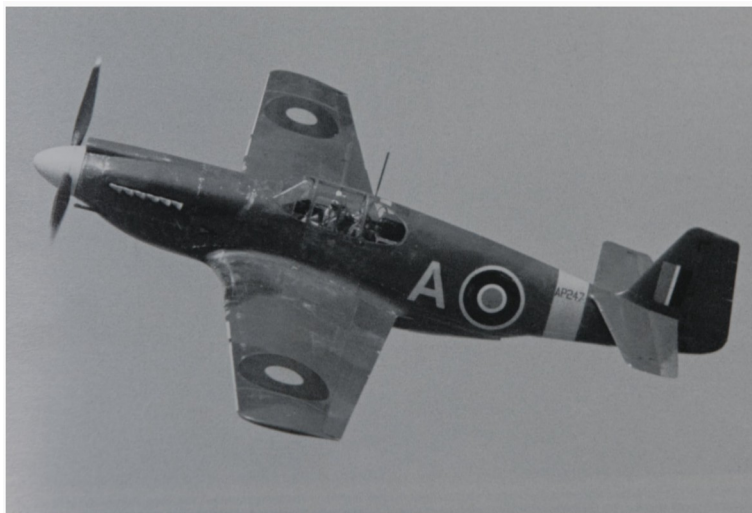
North American Mustang I AP247 of No. 4 Squadron

The Allies military planners were now considering their options for an invasion of Europe, which was expected to take place sometime in 1944. As part of the plans, Allied air power was reorganised, with the Army Co-operation Command being disbanded and the formation of the Second Tactical Air Force (2nd TAF). The TAF also took units from Fighter and Bomber Command and began training to support the Allied Armies in the field. Fighter Command itself was renamed the Air Defence of Great Britain, a title it kept until reverting back later in 1943.