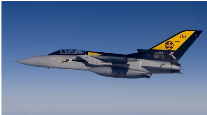
Royal Air Force (RAF) Panavia Tornado F3 of No. 111 Squadron RAF.

Forty-six years ago today, the Panavia Tornado ADV made its first flight, marking the debut of Europe's formidable long-range interceptor. Developed by Panavia Aircraft GmbH as a specialized variant of the Tornado multi-role fighter, the ADV was built to defend the United Kingdom and NATO airspace from Soviet bombers during the Cold War. With its powerful radar, Mach 2.2 top speed, and ability to carry advanced air-to-air missiles, the Tornado F3 became a cornerstone of RAF air defense until its retirement in the early 2010s.